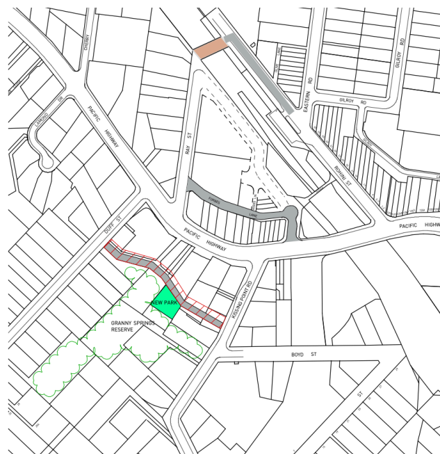
Figure 14B.7-1: Environmental protection and bush fire protection plan. (Refer to Part 14R.4 Turrumurra Community Hub Masterplan).